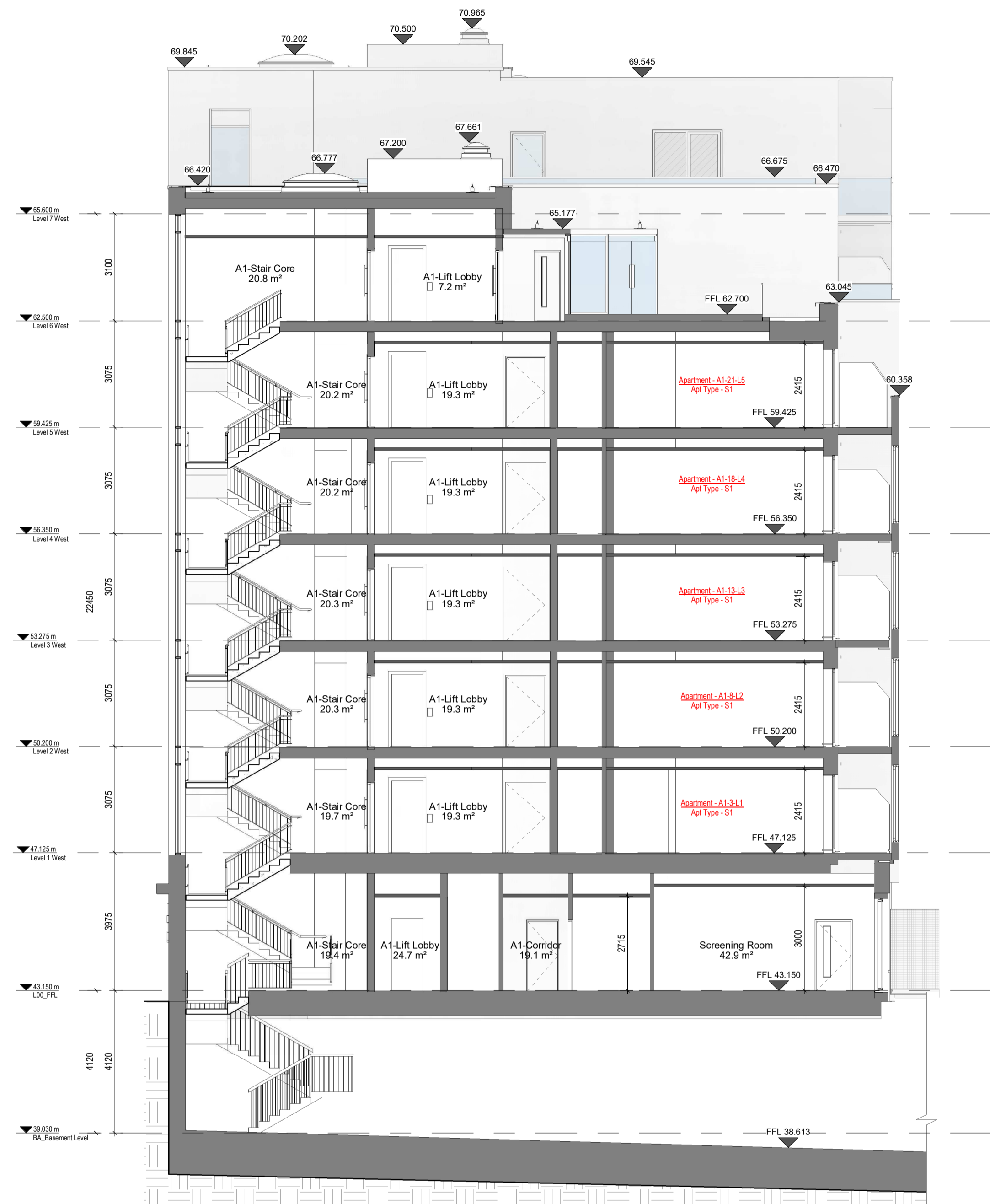
1 GA - Section AA 1:100